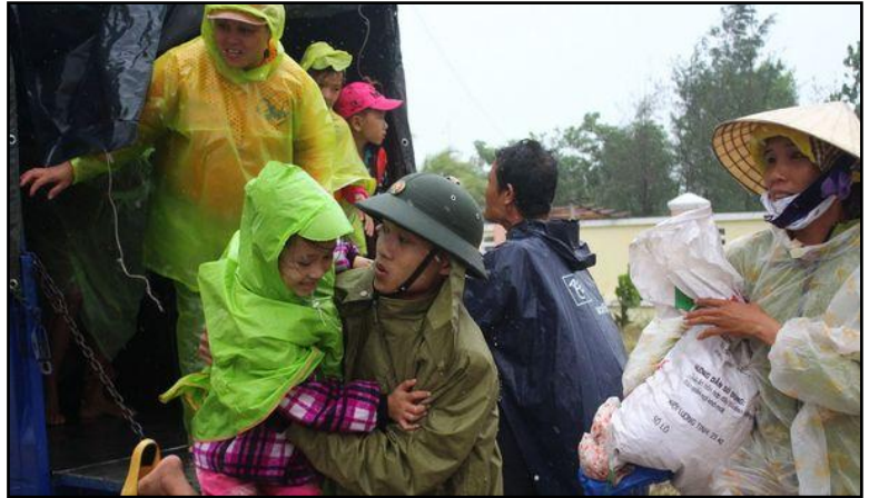
Evacuation of population before the typhoon HaiYan

Preliminary damages caused by Haiyan as reported by the Central Committee for Storm and Flood Control (CCFSC) on 11 November 2013: