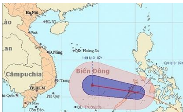
Storm Zoraida as of 13 November

Due to the depression's circulation, the southern East Sea will have rough sea and winds as strong as 74kph and gusts of 989-102kph, starting from noon 13 November.