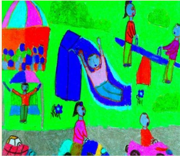
Playing in the Park Drawn by the children of Ha Noi