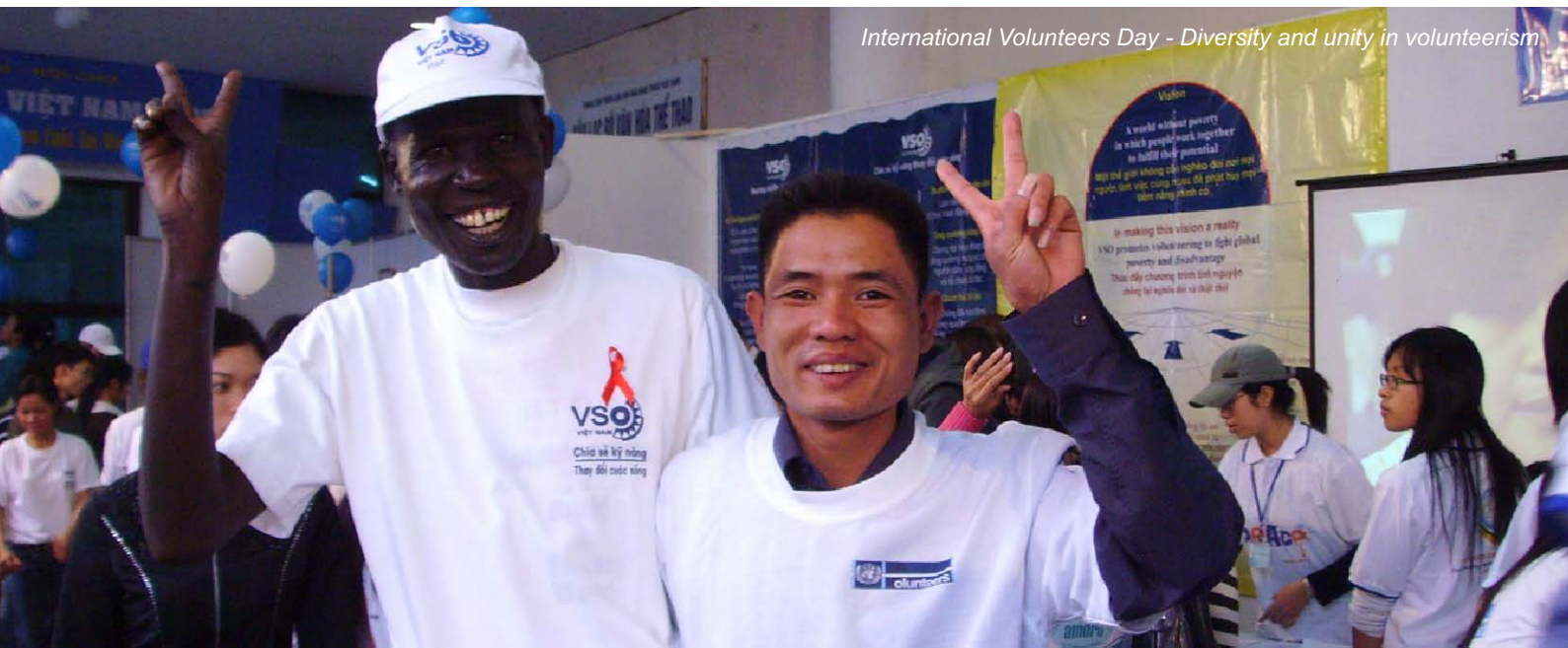
International Volunteers Day - Diversity and unity in volunteerism

It is important to highlight that due to the One UN Initiative in Viet Nam, the UNV Country Office has been able to mobilise good backing for the projects it supports, particularly the VVIRC, from UN agencies, the Vietnamese Government, civil society, NGOs, and national VIOs. Under the One Plan Fund, UNV has been allocated US$488,000 to support National Implementing Partners in HIV and National Volunteer Infrastructure projects during 2008-2010.