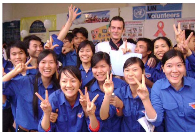
Hanoi IVD celebration: UN university volunteer from Spain with Ho Chi Minh Communist Youth Union volunteers

Another strategic area UNV should give priority to is to increase the number of Vietnamese volunteers to contribute their skills internationally and especially in the region. There are many mid-career Vietnamese professionals, but very few see the international UNV modality as a real opportunity. This view may change with the establishment of the VVIRC.