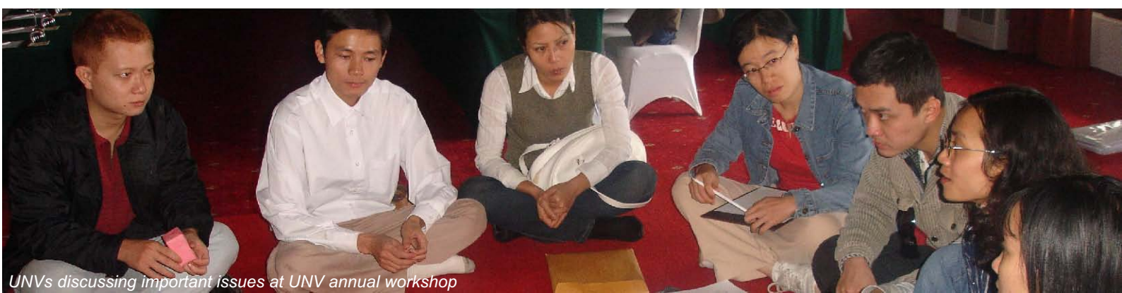
UNVs discussing important issues at UNV annual workshop

This programme will have the collaboration of the Ho Chi Minh Communist Youth Union (HCYU) and other relevant stakeholders to create an environment that will facilitate the access of Vietnamese youth, especially vulnerable rural youth, to career and life opportunities and meaningful employment through employability initiatives such as 'volunteerism for employability' in rural areas.