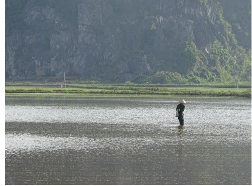
Flooded paddy fields in Tam Coc, Ninh Binh province