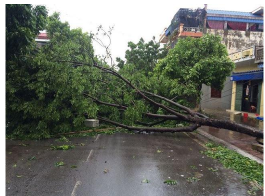
Collapsed trees in Nam Dinh province